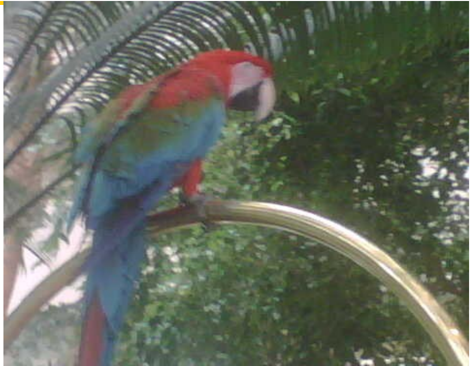
The picture above is of the parrot